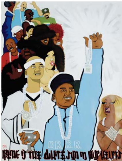
Iona Rozeal Brown 23 Bling Propaganda #3 Estimate: $5,000-7,000