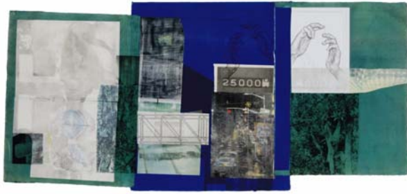
Robert Rauschenberg Guide (Rigs) Estimate: $60,000-80,000

of $2.8-4 million for 266 lots – the largest and most valuable to date – this June’s Open House sale is likely to build on the success established by the Post-War and Contemporary sales earlier this spring.