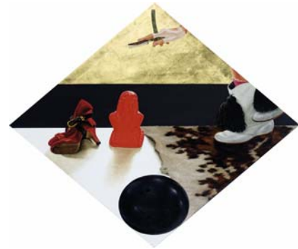
Barkley Hendricks Big Guy (Three Game Series) Estimate: $8,000-12,000

The catalogue opens with a selection of works from the Collection of Peggy Cooper Cafritz of Washington D.C. A staunch supporter of the arts and longtime patron of African American artists, Ms. Cafritz began collecting whilst studying in college and has today amassed a collection of critical importance, which reflects her unique vision and connoisseurship of the pioneers of the African American arts movement. Highlights include Carrie Mae Weem’s You Became a Scientific Profile/ An Anthropological Debate/ A Negro Type/ & A Photographic Subject (estimate: $20,000-30,000), Glen Ligon’s Malcolm X (estimate: $20,000-30,000), Robert Colescott’s Yo Sign, Yo Yard?, Yo Marriage (estimate: $25,000-35,000) and Barkley Hendricks’s, Big Guy (Three Game Series) (estimate: $8,000-12,000).