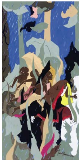
Jacob Lawrence Flight #1 (Walking in the Rain) Estimate: $120,000-150,000